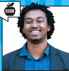
KIDUS EGZI Charter College of Education Representative