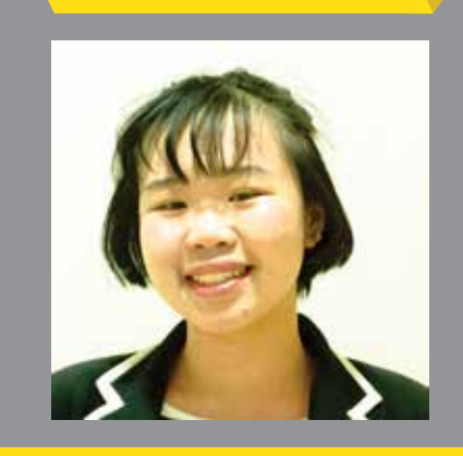
Candidate for Undergraduate Academic Senators