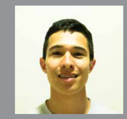
Candidates for College Representative: College of Engineering, Computer Science

As a member of the ECST college; I am excited to represent the students..