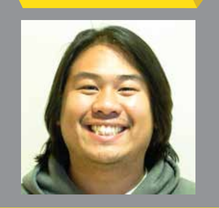
Candidate for Community Affairs Rep-At-Large

My intention to apply is to improve the experiences for organizations. Considering I run two organizations, I understand the difficulties as well as the struggles to succeed. Through my experience as an organization leader, I plan to use it to my advantage in order to improve our current situation.