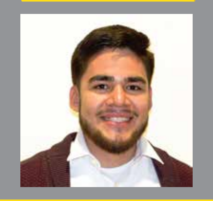
Candidate for Vice President for Academic Governance

I am for student involvement on campus because not only will our students receive the education they should be entitled to while attending class here at CSULA, but students will also be able to carve a road-path towards what profession they desire to pursue. Going to school just for an education isn't enough. It is important for students to understand that they must network while they are in college because many employers are typically looking for educated and ambitious students who want to gain experience in the profession they are studying for. Student involvement on campus will help students begin obtaining the proper skills they need in order to build a strong resume and compete effectively out in the job market. As long as our University will continue to provide students with access to the resources they need in order to get started on their future careers. I will continue to advocate and guide students towards these resources that will benefit them and their futures. I want my school to be known for not just its' academics, but I want Cal-State-LA to be known for preparing students in terms of having a brighter future.