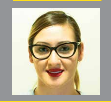
Candidate for College Representative: College of Arts & Letters