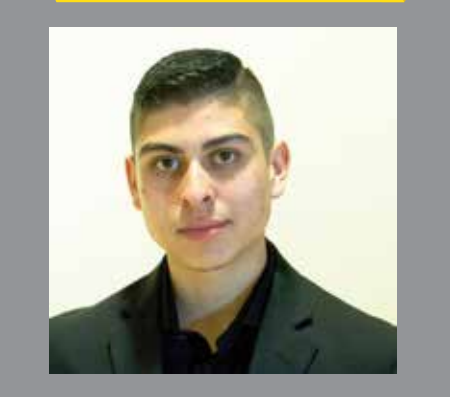
Candidate for College Representative: College of Arts & Letters