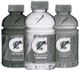
Gatorade Perform, Variety Pack, 12 oz, 28 ct $16.77