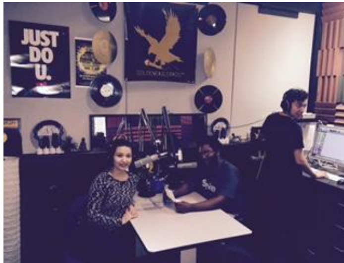
Our Golden Eagle Radio Studio in King Hall.

At Golden Eagle Radio we aim to foster the growth and the development of CSULA Television, Film and Media Studies (TVF) students. We would also like to provide an opportunity to non-TVF students to participate in this station as well, and encourage their involvement. We aim to inform, promote and highlight various on and off campus activities, events, foundations, clubs, organizations, departments, artists, musicians, etc. in order to bring California State University, Los Angeles and the entire Los Angeles community, together.