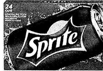
Sprite - 24pk/12 fl oz Cans Sprite $8.99