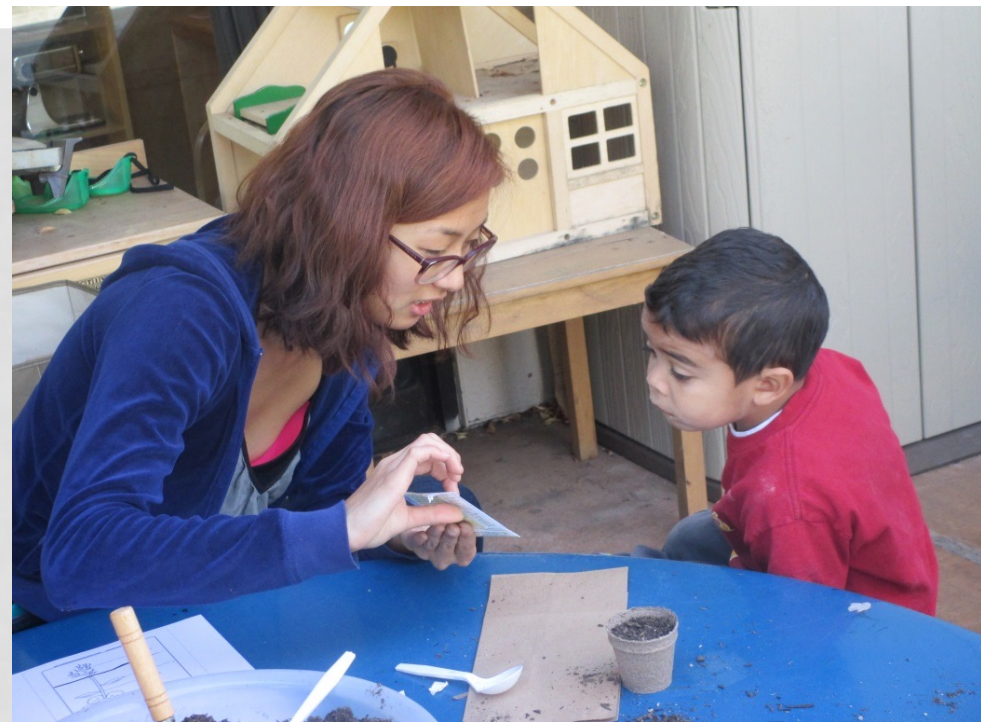
Memories with ASI: Gardening Day