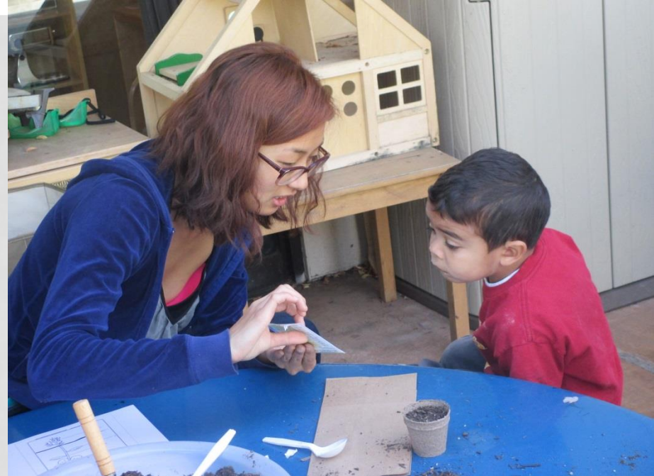
Memories with ASI: Gardening Day