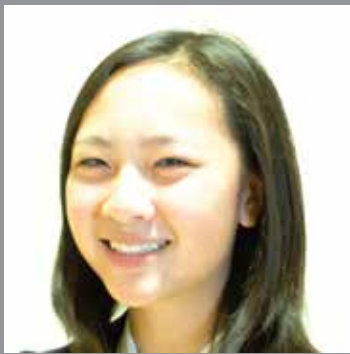
Candidate for Undergraduate Academic Senators

As academic senator, I will advocate for students by communicating with faculty about student concerns and opinions. I will make sure that our voices are heard so that the faculty is aware of our concerns and can address them. I believe that many of our problems on campus can be solved by simply being proactive in campus wide discussions. I look forward to representing the students in these discussions so our needs can.