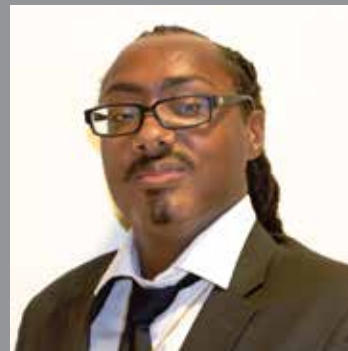
Candidates for Vice President for Administration