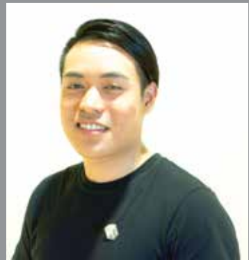
Candidate for President