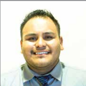
Candidate for Vice President for External Affairs and Advancement

Cal State L.A. is a culturally rich and diverse campus, which I am extremely proud to belong to. Students come from all backgrounds, but we all share the fact that external policies affect our education. Most of us are working students and face similar daily challenges. I also have to balance work, school and family responsibilities, while taking the maximum allowable units every quarter to graduate in the shortest amount of time possible. I want to be an agent of change and represent people in the most equitable way possible. This is why I am running for this office - I want to be the voice of all students with our CSU Board of Trustees and state legislature. I want to be the eyes and ears of students of all colors, of students who work and commute, of students who live on campus, of students who have a family to sustain, of students with disabilities, of Dreamers, of LGBT students, just to mention a few. As VPEAA, I will make sure that all of our issues are advocated for because I want to recreate a connection between ASI student representatives and the student body. I will make sure I am accessible to all students and that everyone's voice is being heard equally. I do not want people to see me as an out of touch representative, but rather as a working student who wants to work hard for you.