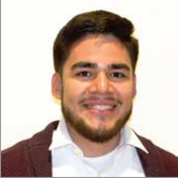
Candidate for Vice President for Academic Governance

I am for student involvement on campus because not only will our students receive the education they should be entitled to while attending class here at CSULA, but students will also be able to carve a road-path towards what profession they desire to pursue. Going to school just for an education isn't enough. It is important for students to understand that they must network while they are in college because many employers are typically looking for educated and ambitious students who want to gain experience in the profession they are studying for. Student involvement on campus will help students begin obtaining the proper skills they need in order to build a strong resume and compete effectively out in the job market. As long as our University will continue to provide students with access to the resources they need in order to get started on their future careers, I will continue to advocate and guide students towards these resources that will benefit them and their futures. I want my school to be known for not just its' academics, but I want Cal-State-LA to be known for preparing students in terms of having a brighter future.