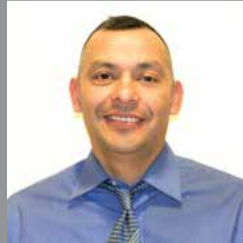
Candidate for College Representative: College of Arts & Letters

I am a hardworking, driven, passionate, and dedicated student. I will bring these traits into the association if elected. I will work hard in bringing more exposure and better ways to reach out to students. I am a great collaborator and want to work to help students meet their academic needs. I will be available for any requests and questions from students. I will make it a major priority to my career as a student to advocate for students. I will give the best that I have from my part in order to get make the most out of the school year. I will collaborate with fellow officers and also fellow clubs and committees. I want to be able to work with other groups to strengthen and unify our campus population. I want to do volunteer in our community and get more volunteers to join us.