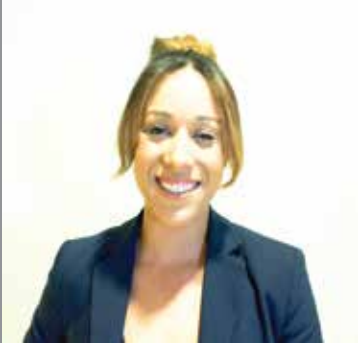
Candidate for President