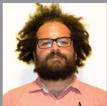
Candidate for President

Upon my arrival at Cal State Los Angeles, I found myself seeking ways that I could get involved. I immediately joined the Residence Hall Association and the Phi Sigma Kappa fraternity; both organizations focused on community and social interests. In an effort to become more involved and grow as a leader, I ran for Vice President of Administration for A.S.I. Through my time in the student body, I honed in on my advocacy and leadership skills so I can best represent the interests of all our students. It was also important for me to get the perspective of the students as I made decisions, reaching out to them and asking for opinions as I considered upcoming important votes and decisions for the population. Through genuine motives, I led the student body and helped bring together students for advocacy and programming. I wish to continue this trend by serving the student body as the President of Associated Students Inc. If elected, I will use the position to reevaluate the structure and function of Associated Students Incorporated and pursue a greater vision so that we can better represent the students that have elected us. I want to make A.S.I. a powerhouse of advocacy on our campus.