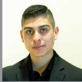
Candidate for College Representative: College of Arts & Letters

I welcome the opportunity to contribute work towards ASI student government in a leadership position. If elected, I will bring to ASI my experience as an active member and proven leader within the College of Arts and Letters. I am the current standing president of Cinematic Visions, the official film club of Cal State LA, as well as an active member of Golden Eagle Productions. Other Leadership positions I have fulfilled include my experience as a director for short films and an episode of Golden Eagle Television's original series The Hill. If elected as a board member for ASI I would fully utilize my leadership and communication skills to adhere to the interests and concerns of students within the College of Arts and Letters and respond accordingly.