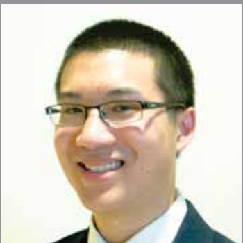
Candidate for Community Affairs Rep-At-Large

I plan to make big changes for CSULA students. 1. I support timely promotion and marketing of events. 2. I support awareness programs in terms of race/ethnicity, sex, and disability (e.g. Black History Month, National Hispanic Heritage Month) 3. I support education for body image, dating violence, etc., and speakers to discuss topics in an open, safe forum. 4. I support programs such as Breast Cancer Awareness, HIV/AIDS awareness, Latino AIDS, and vaccinations and baby changing stations to suit community medical needs. 5. I promote education on drunk, buzzed, and distracted driving. 6. I advocate anti-bullying programs for minority groups, and safety for all people and ideas. 7. I promote job fairs, Involvement Fairs, and internships, especially for undeclared majors, and also for undocumented immigrants. My courage, enthusiasm and energy best suits providing and presenting more opportunities to improve our student community to its greatest potential.