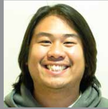
Candidate for Community Affairs Rep-At-Large

My intention to apply is to improve the experiences for organizations. Considering I run two organizations, I understand the difficulties as well as the struggles to succeed. Through my experience as an organization leader, I plan to use it to my advantage in order to improve our current situation.