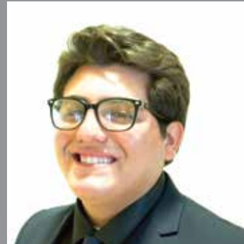
Candidates for Vice President for Administration

Being a student amongst a diverse, determined and ambitious community at this university deserves the up most support from their student government. As your Vice President for Administration, I will commit to help out my fellow ASI members in whatever duties and challenges they take on because cooperation and communication are crucial to achieve the goals of this campus and their students. Most importantly, I will work to ensure the focus and quality that it takes to present a respectful, active and straight awe inspiring student environment.