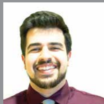
Candidate for College Representative: College of Business & Economics

The three years that I have been at this university I have made a lot of connections. Those connections made specifically in my major as well, whether it be from classes or coming up to students around Salazar Hall. I'd like to represent my people and start something great with the rest of ASI. I'm very focused and dedicated when it comes to organizing activities.