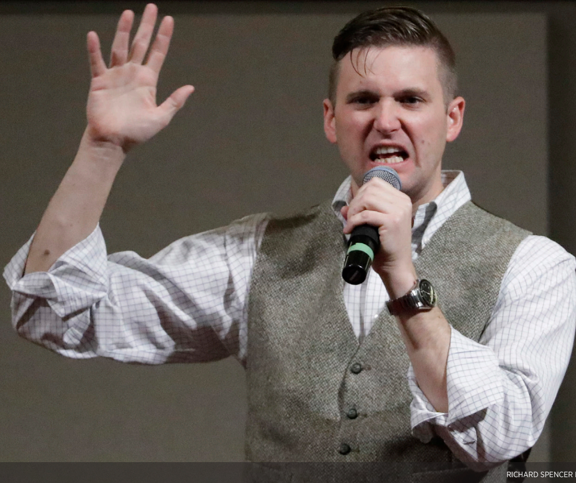
RICHARD SPENCER IS A LEADING ALT-RIGHT SPEAKER.