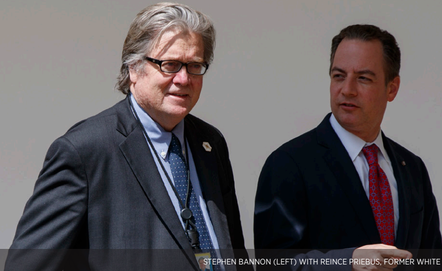
STEPHEN BANNON (LEFT) WITH REINCE PRIEBUS, FORMER WHITE HOUSE CHIEF OF STAFF

STEPHEN BANNON — Before he became the chief strategist for Donald Trump, Stephen Bannon, 63, was the chief enabler of the alt-right movement. Without Bannon’s ascension to the Oval Office, the movement would likely still be confined to the dark corners of the internet. Born to a working class family in Norfolk, Virginia, Bannon joined the Navy and worked his way up to a Pentagon job.